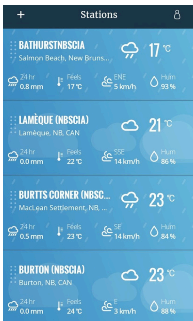
The WeatherLink homescreen