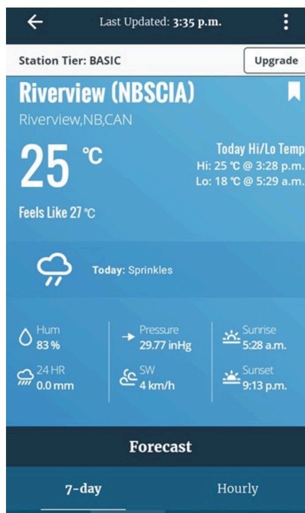
A closer look at station data

Contact your NBSCIA coordinator to see soil temperature data for NBSCIA stations and for assistance with the app.