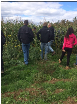
Field day in Miramichi

R & R Ag Services to observe their current corn crop and to discuss their operation and production methods. The attendees and David walked in the corn field and discussed the crop. Equipment was on hand for observation as well. Topics including localized weather were also a topic of discussion in relation to the corn crop. Overall, the day was a great learning opportunity for the members of the region and everyone enjoyed the enthusiasm and engaging nature of David's presentation. It was also great to see some of the members even brought their children to take in the day.