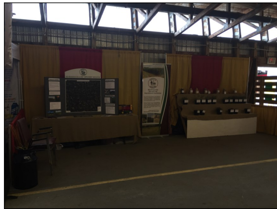
NBSCIA booth at the NBEX in Fredericton