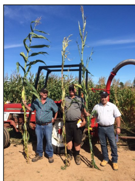
Tallest corn competition winners, Kings County field day.

The first field day of the season was in Sussex and what a turnout we had (50+ people)! We toured the corn plots, had a precision corn seeder demonstration, a tallest corn competition and a great lunch.